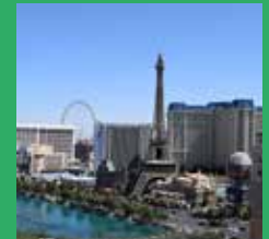
ISHA ASM 2021 Update