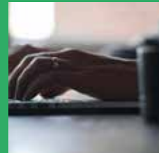
The Global Hip Presentation Registry – ISHA Members' Survey